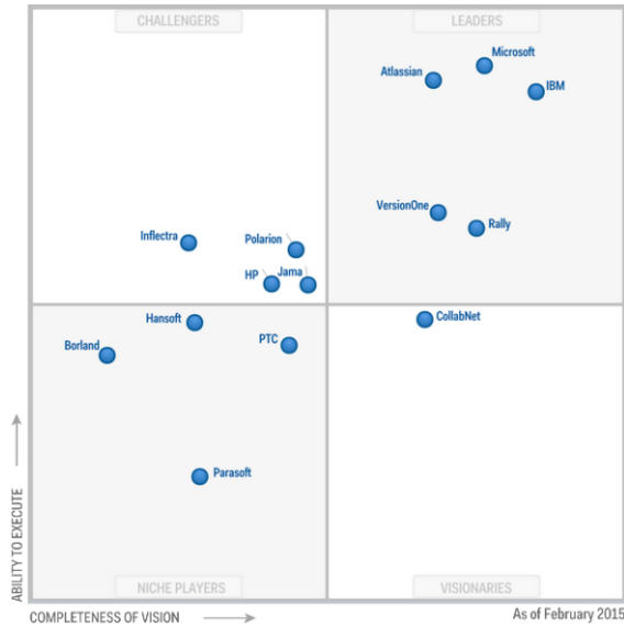
Figure 1. ALM providers and their capability [5]

has to be collected and the choice from a wide variety of vendors has to be proved. Considerable aspects can be read in [3,4]. Vendors on this market provide both comprehensive, general systems, and programs to solve particular problems at this field. On Fig. 1. some of the important vendors are compared regarding their completeness of vision and their ability to execute.